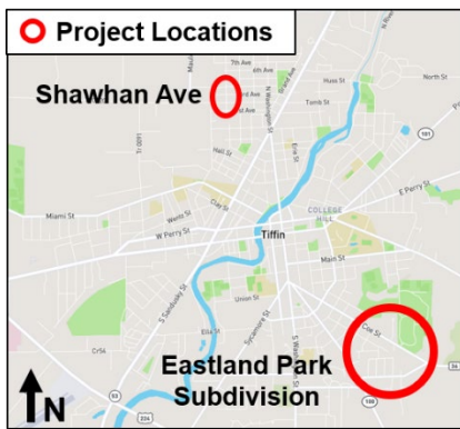
Above: Project Areas

Contact the Public Works Department at publicworks@tiffinohio.gov for SHP Files of Tiffin’s sewers, a polygon of the project area, and a listing of feature numbers that make up the above quantities.